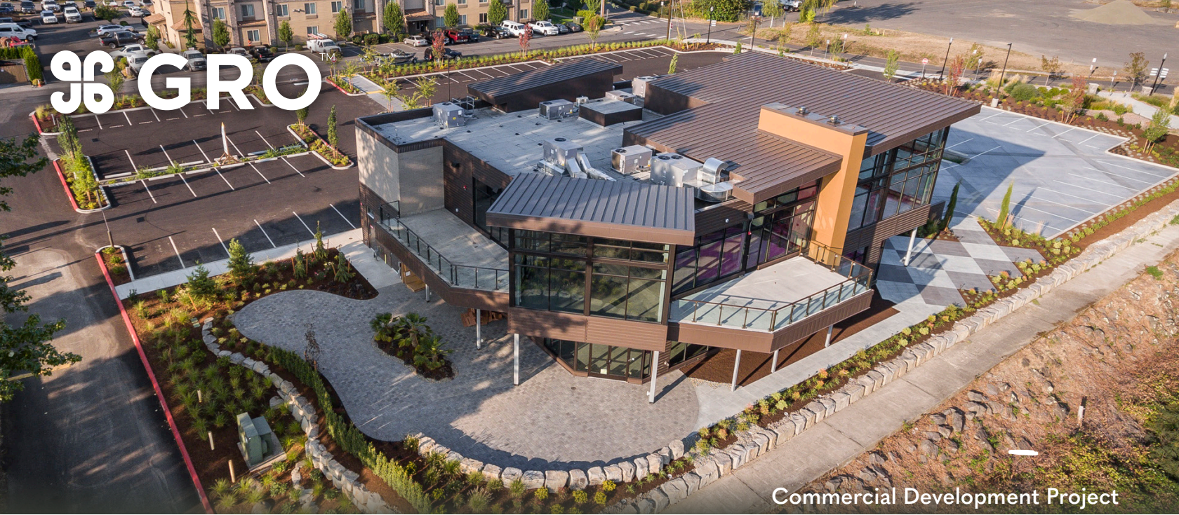
Commercial Development Project