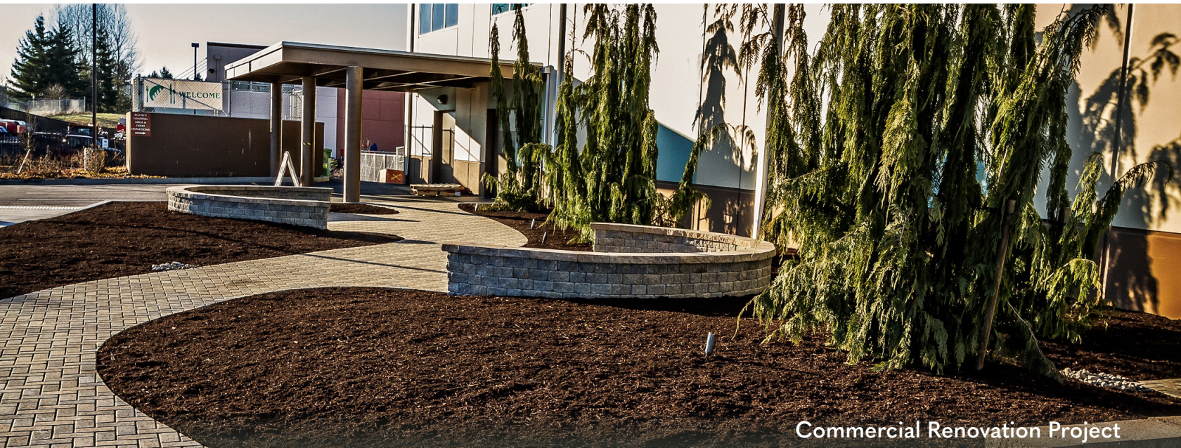
Commercial Renovation Project